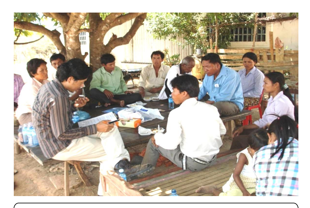
Post-constituency dialogue focus group in Chhean Leung commune, Samaki Meanchey district, Kampong Chhnang province on February 27, 2010.

Three participants inquired about the policy differences of the parties, including the different dates on which the parties celebrated peace (January 1979 for the CPP and the anniversary of the 1991 Paris Peace Accords for the opposition). They emphasized their desire for parties to work together. Two participants asked about immigration legislation. Three participants reported that police took bribes through illegal checkpoints and district tax officials were illegally taxing farming equipment. Participants also requested a bridge, a health center, lower gas prices, and a crackdown on youth gangs. One participant specifically asked NDI to open offices in the communities to better report the concerns and difficulties of the people to the NA and the government. He also asked NDI to organize forums in all 24 Cambodian provinces.