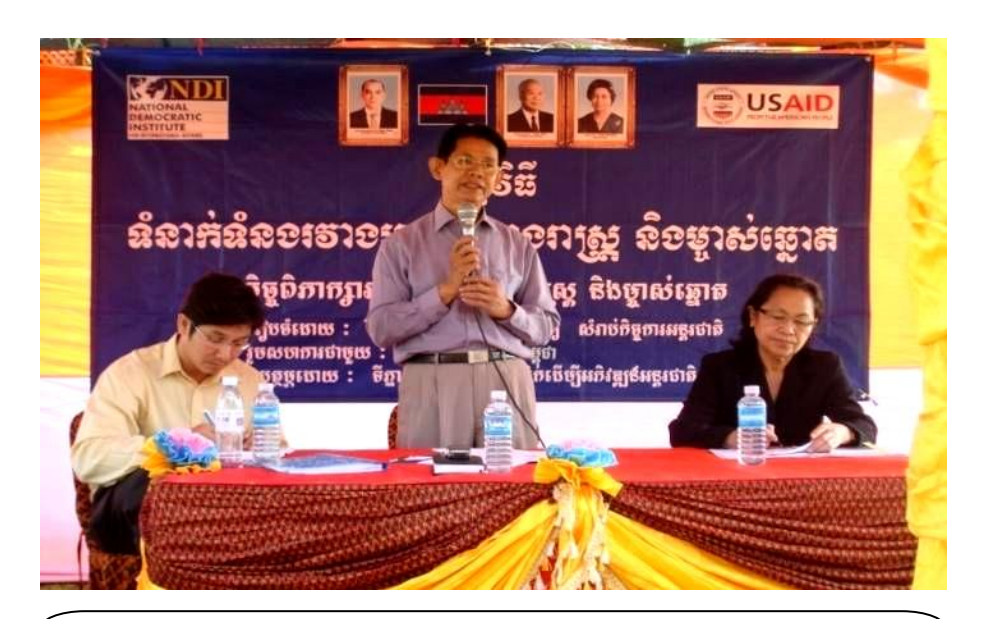
A MNA speaks during a constituency dialogue in Kat Phluk commune, Boseth district, Kampong Speu province on August 28, 2010.

Fifteen citizens spoke during the Veal Lo Veang dialogue, including three women. Seven participants described land conflicts, several speaking on behalf of many families. Three described how 80 families from Phnom Tou Teng were being evicted from their land by high ranking officials and had their houses burned down by army officers. They had travelled with 10 people from their village in the mountains