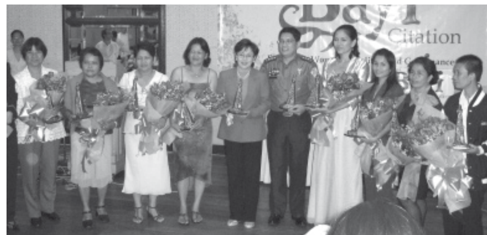
Winners of the Bayi Citation Award 2007. The Award is given biannually to ten champions of women's rights and good governance, Philippines.

And finally, a recommendation to the AEPF Organising Committee to set up processes to implement its agreed gender and disability commitments and to eliminate bias in participation, selection of panellists, speakers, chairpersons and discussants.