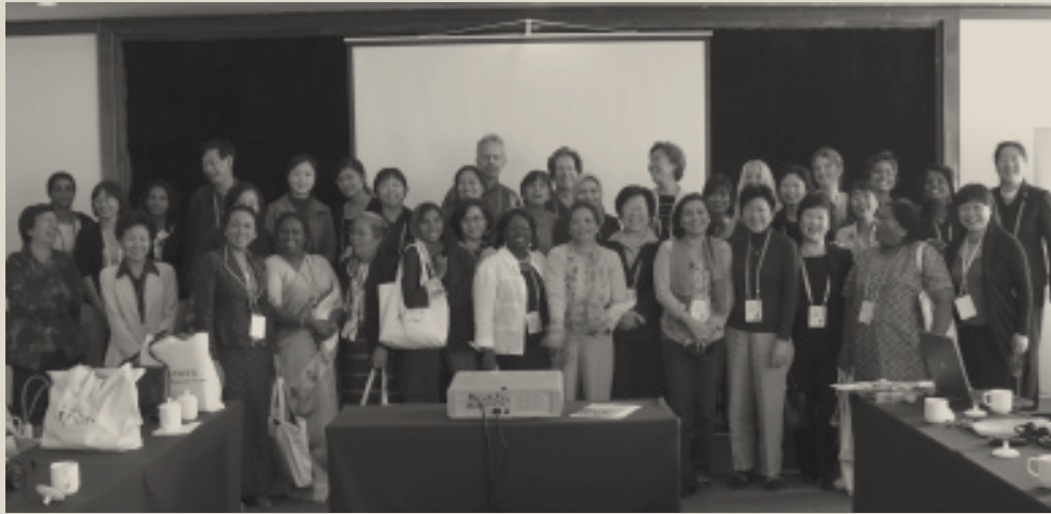
Participants of the AEPF-7 workshop 'Strengthening Women's Political Participation and Influence', Beijing, October 2008

The Just Politics Programme is funded through our Programme Partnership Agreement with the Department for International Development, UK