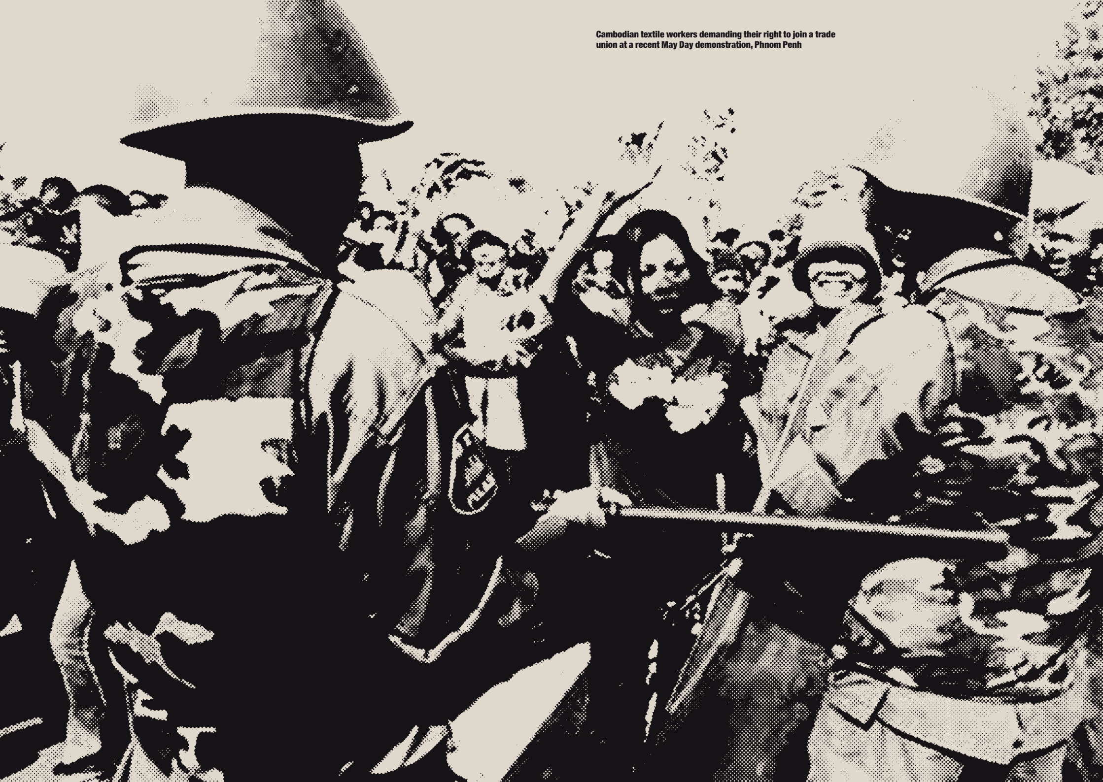
Cambodian textile workers demanding their right to join a trade union at a recent May Day demonstration, Phnom Penh