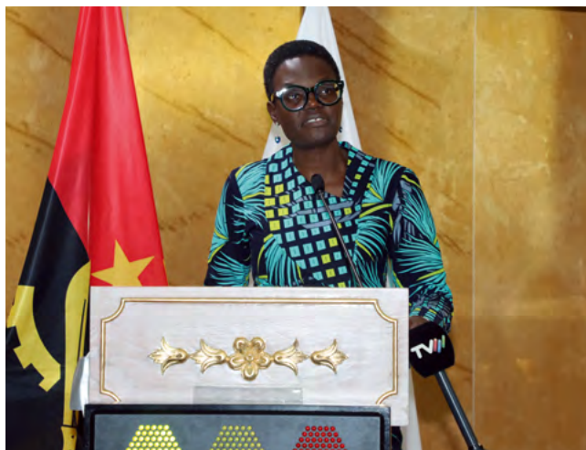
Tulia Ackson was elected 31 st President of the IPU in October.

Overall in 2023, the IPU organized 75 global and regional events and 45 national activities in 12 countries to support key parliamentary functions as well as more specific thematic areas such as promoting gender-sensitive parliaments and implementing the sustainable development goals (SDGs).