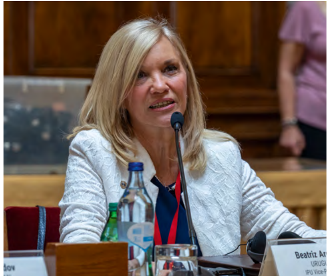
Beatrice Argimón, President of the General Assembly and the Senate of Uruguay

In June, the IPU signed an agreement with the Government of Uruguay on the establishment of the IPU’s first regional office in Montevideo. The future office will deepen the IPU’s engagement with parliaments in the Latin America and the Caribbean region by encouraging inter-parliamentary cooperation and helping the IPU to implement its global strategy.