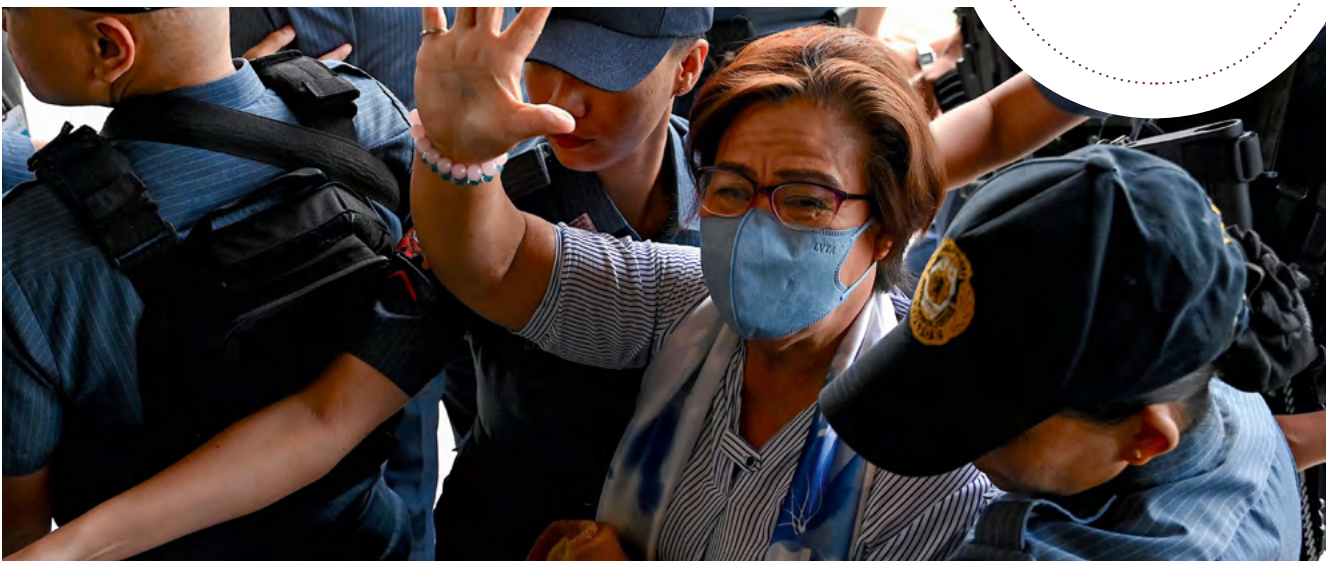
Senator Leila de Lima from the Philippines was released from prison in 2023 partly thanks to IPU lobbying.

The Committee's work in 2023 led directly to the release of nine MPs, 1 although our data also shows that MPs' human rights have never been under so much pressure. Overall, the number of human rights violations against MPs continues to rise, with a total of 762 cases in 2023, up 38% from 550 in 2020. These figures probably represent just the tip of an iceberg of many more cases that go unreported. Most of the violations are State-sponsored, an indication that democracy may be backsliding in some places. More than 80% of the cases involve opposition MPs, and the most common violations relate to freedom of expression.