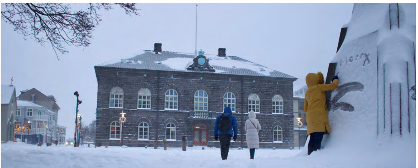
The Althingi © Parliament of Iceland

Indeed, as the Icelandic case has shown, we cannot afford to be complacent about democracy and gender equality.