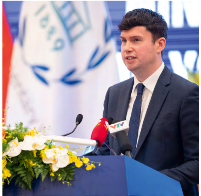
Dan Carden, President of the IPU Board of Young Parliamentarians at the Ninth Global Conference of Young Parliamentarians in Viet Nam.

Gabon, Mexico and Zimbabwe also changed their constitutions with a view to involving more young people in their parliaments, including by lowering the age to run for President, aligning MP eligibility ages with the voting age, and increasing the quota of parliamentary seats for youth. See Part 2 , Chapter 5 for more information about Mexico.