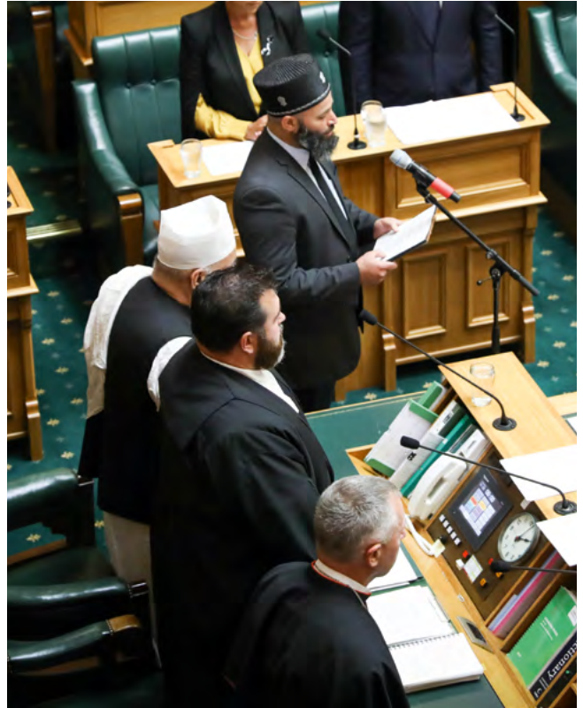
Religious leaders were invited to the New Zealand Parliament after the Christchurch mosque attacks in 2019.

Hundreds of parliamentarians came from 70 countries to attend the Morocco meeting, while its outcome document – the Marrakesh Communiqué – called for an end to hatred. It encouraged parliaments to be more mindful and inclusive of faith and religion when developing national legislation and international commitments, and in promoting social cohesion.