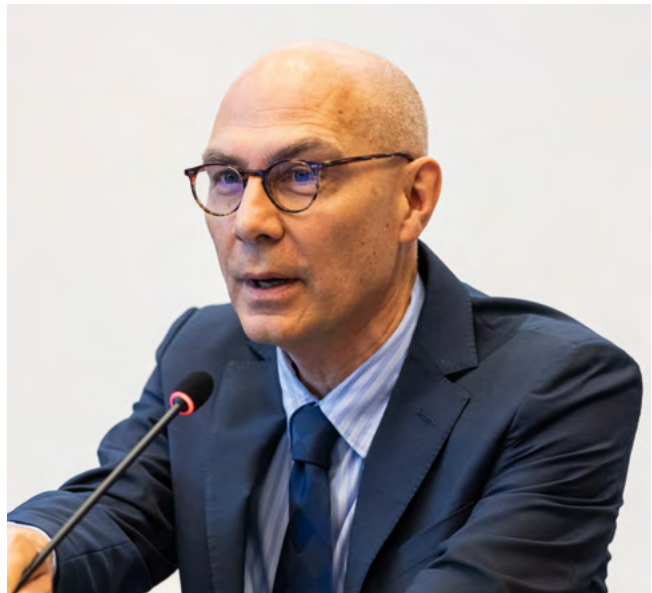
Volker Türk, UN High Commissioner for Human Rights.

At the halfway point of the 2030 Agenda, the sustainable development goals (SDGs) are another area of IPU's engagement with the UN and its processes. We have engaged parliaments in multiple ways on this issue, including holding a meeting for parliamentarians from around the world on the sidelines of the UN High-Level Political Forum on Sustainable Development in New York, and the Fifth Interregional Seminar on the Achievement of the SDGs jointly organized by the IPU and the National People's Congress of China.