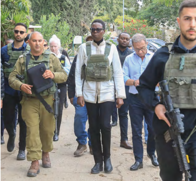
Tulia Ackson, IPU President, visited Israel and the West Bank on her first official trip.

In November, IPU President Tulia Ackson travelled to Israel and the West Bank, her first official trip since her election to the role in October. At the time of writing, with peace elusive in the region, the IPU's Committee on Middle East Questions is actively trying to create a space for dialogue between parliamentarians from the region, including representatives from Israel and Palestine.