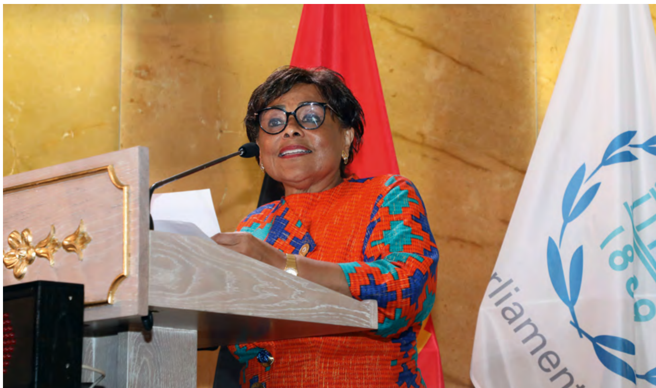
Carolina Cerqueira, the Speaker of the Parliament of Angola, host of the 147 th IPU Assembly.

Our two IPU Assemblies in 2023, in Bahrain and Angola, provided ample opportunity for parliamentarians from all over the world to meet and talk including those from countries currently at war.