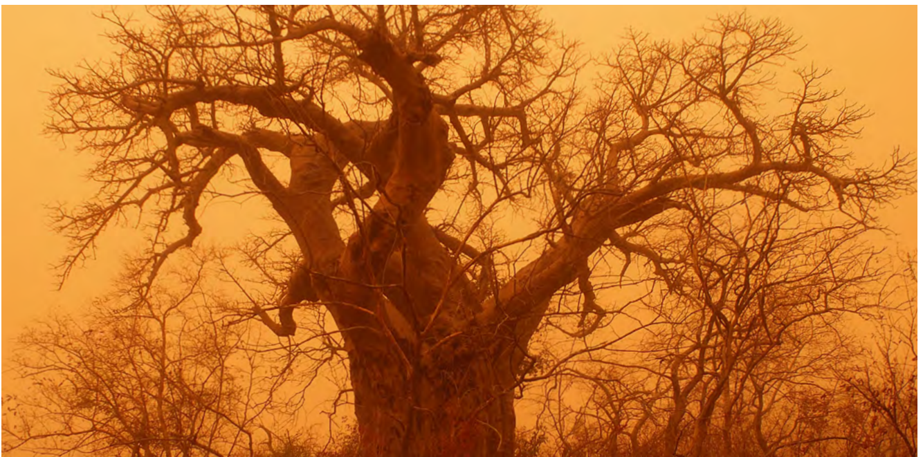
Baobab tree in a sandstorm in Benin.

From fertilizers to the pesticides sprayed on cotton crops, chemicals are widely used in Benin but they are often applied with little knowledge or understanding of the risks. In one harvest season, pesticides poisoned 147 people, including 10 who lost their lives.