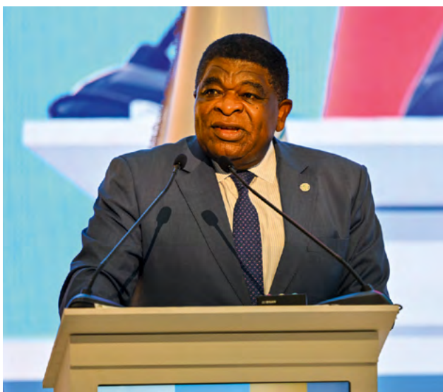
Martin Chungong, IPU Secretary General.

Preparations for a super election year in 2024 have not dampened the sense that democracy in 2023 was on the backfoot. People in the Middle East, Sudan and Ukraine were all too often caught up in the brutal fighting around them, while coups and political instability have continued to undermine the rule of law in the Sahel Region and some countries in Latin America. Weakened by climate change, economic insecurity and growing inequality, many governments are struggling to deliver for their populations. As the legitimacy of those in power is called into question, fertile ground has opened up for the emergence of populist and authoritarian regimes.