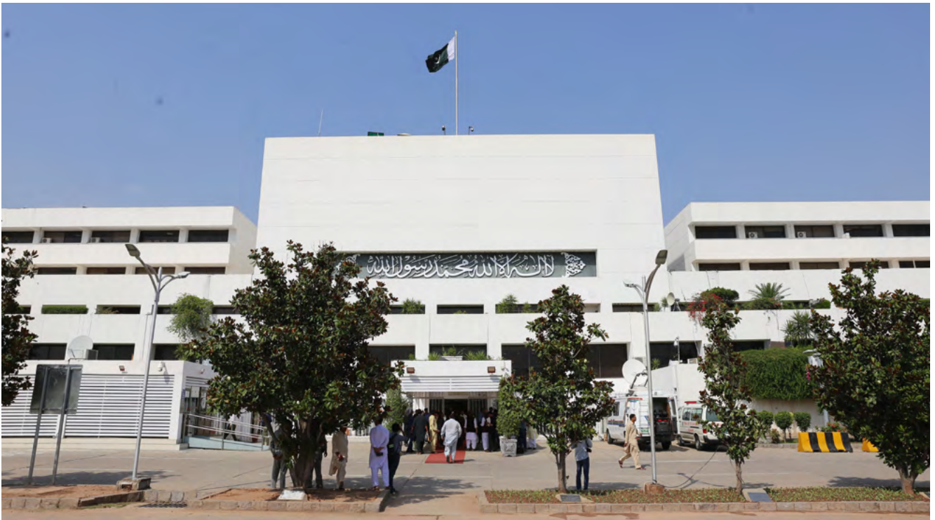
Parliament House, Islamabad, Pakistan.

Some Senators said that the true significance of the assessment had revealed itself throughout the process, which included a thorough review of administrative capacities, accessibility standards and the working environment, as well as of the openness, inclusivity and transparency of parliamentary operations.