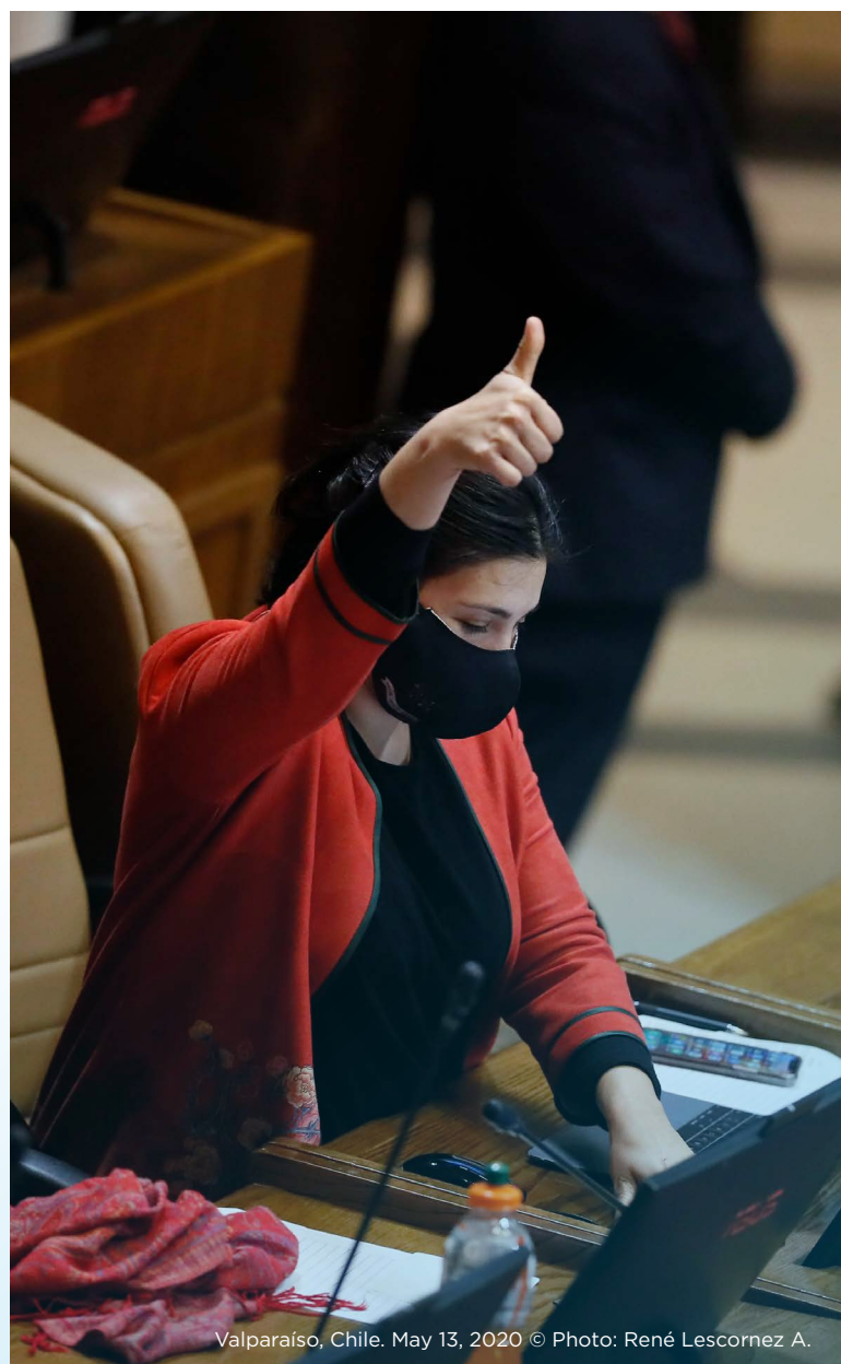
Valparaíso, Chile. May 13, 2020