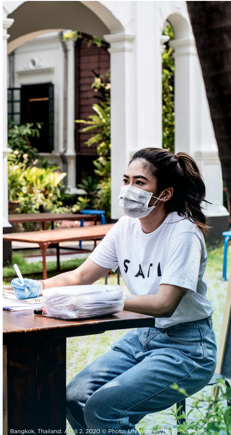
Bangkok, Thailand. April 2, 2020

Parliaments should take the opportunity presented by the pandemic to reflect on the gender sensitivity of their crisis response, and to make changes where appropriate.